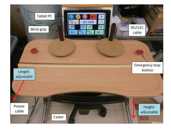
Fig. 4. (Color online) Wrist rehabilitation mechanism.