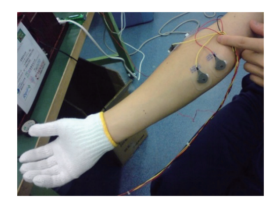
Fig. 3. (Color online) Positioning of myoelectric sensors.