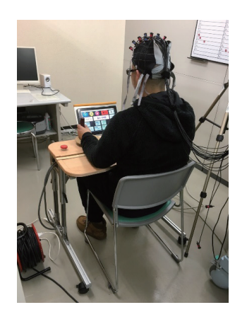
Fig. 7. (Color online) Neuroimaging trial.